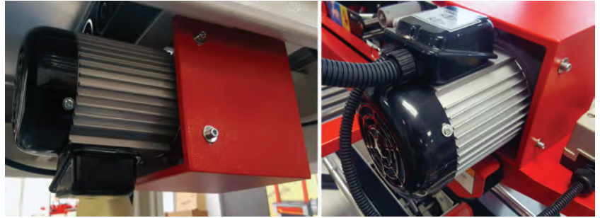
1/4HP Dual Industrial Motors